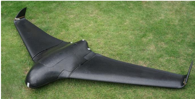
Figure 2 - The Skywalker X8

The airframe is the main structure of the aircraft. Our airframe will incorporate a Skywalker X8 Flying Wing, as seen in Figure 1. The Skywalker X8 Flying Wing is an Expanded PolyOlefin (EPO) foam flying wing. A flying wing differs from a traditional styled plane as it lacks a tail. The Skywalker X8 boasts a two meter wingspan. This wingspan allows for a heavier payload and increased stability. The airfoil used by this aircraft is known as the Sipkill 1.7/10B. This particular type of airfoil is used primarily for flying wings made from foam. The foam body allows for easy modifications to take place.